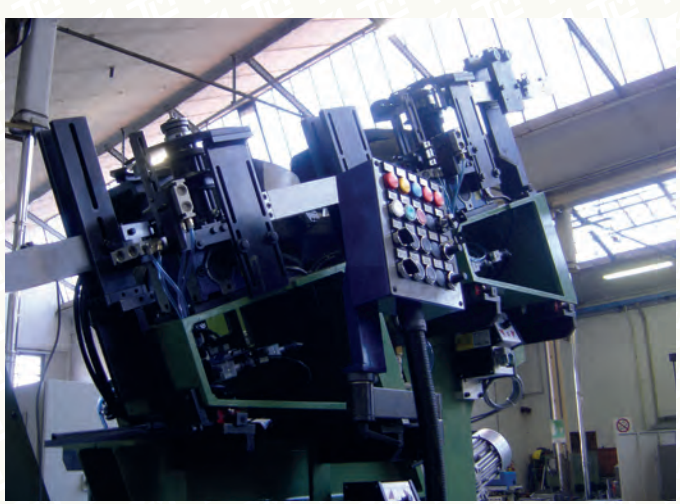
Technical features: approximate values. The machine speed can change according to the material used and the type of item to be rolled. Measures in mm.