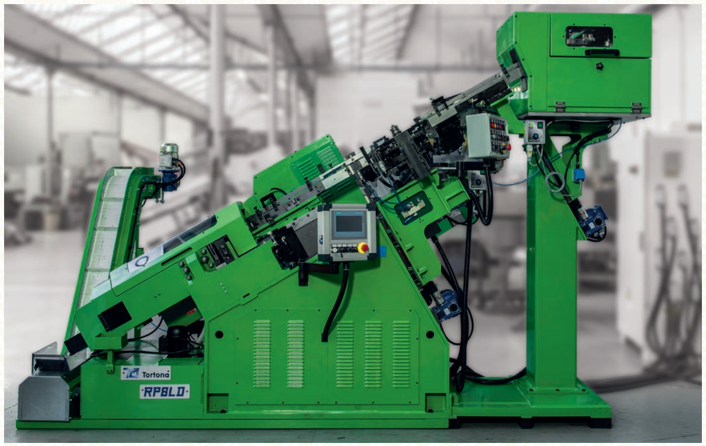
RP8LD with roller block slide in combination with special bushing loader. Bushing loading and rolling up to diameter 16 mm.