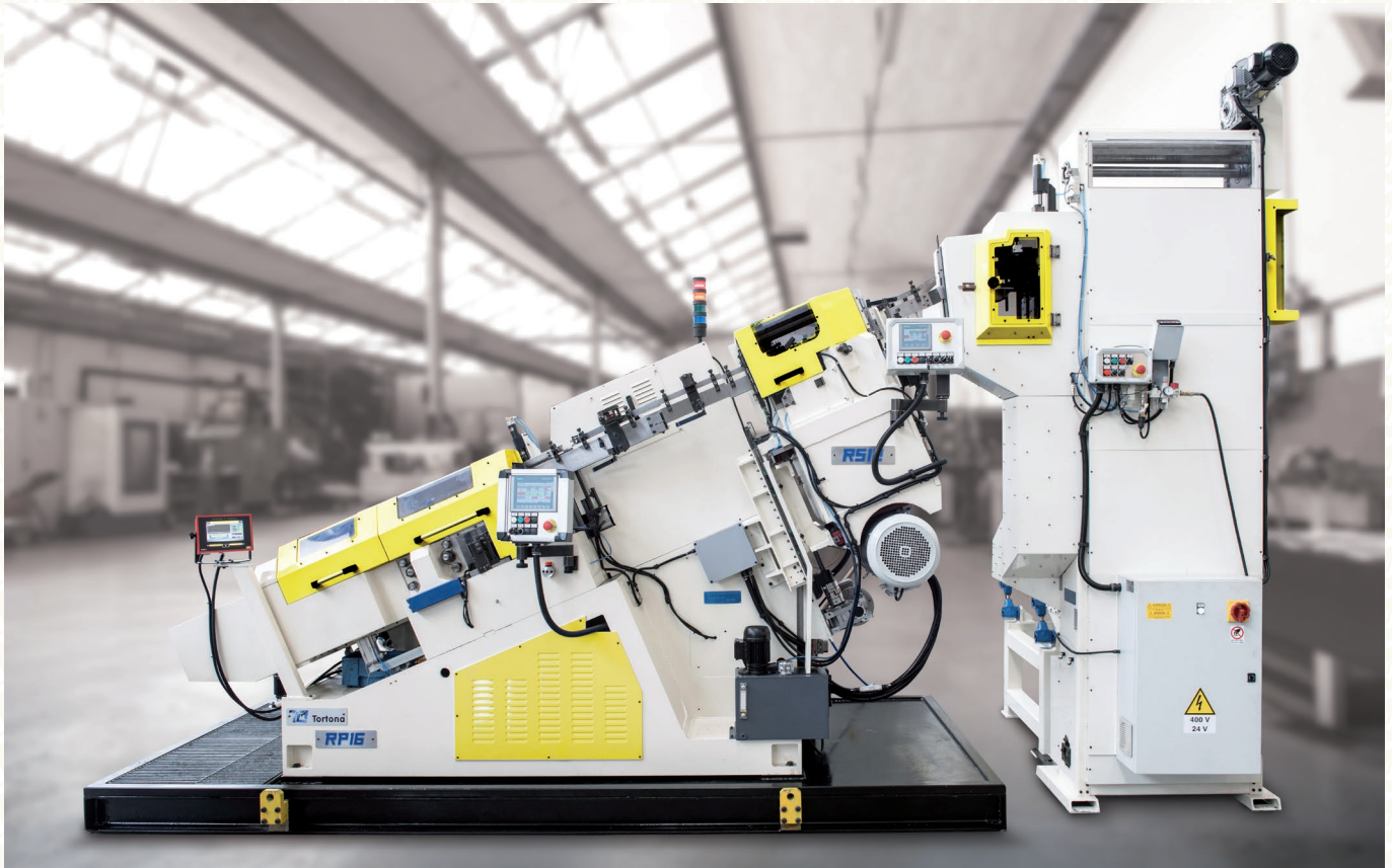
Automatic thread roller with flat dies mod. RP16/S (without rivet magazine)